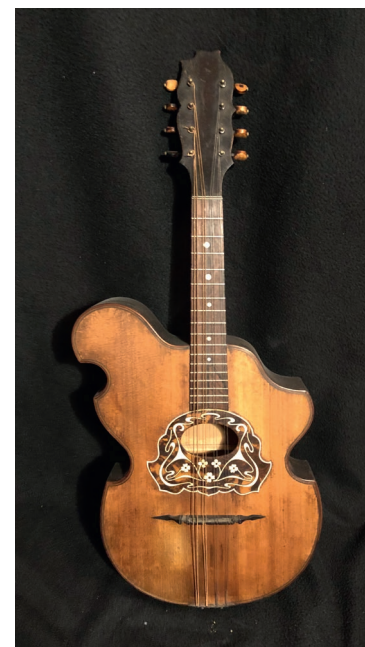
Unknown English(?); 1920s