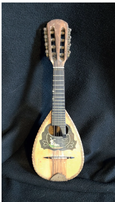
Mini mandolin Germany; 1920s (TL 34cm)