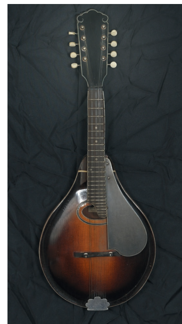
Tjueling Malmberg; 1943