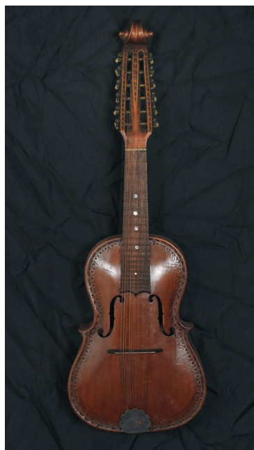
Violin-mandriola Germany; 1920s