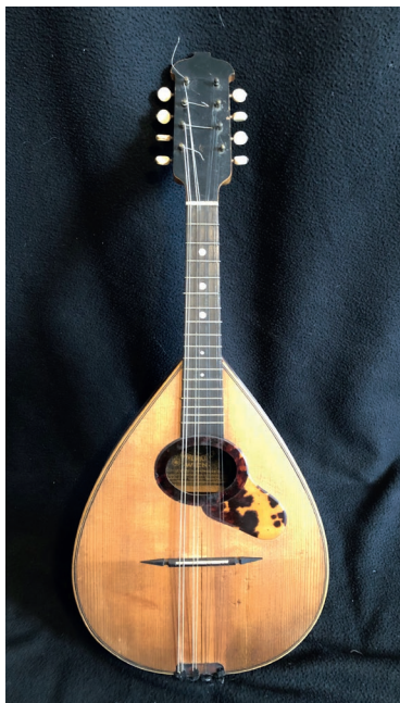
C.Richter Vienna; 1900s