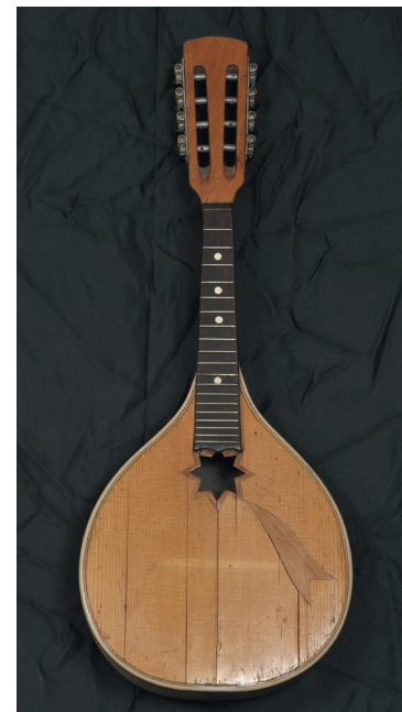
Unknown Germany; 1920s