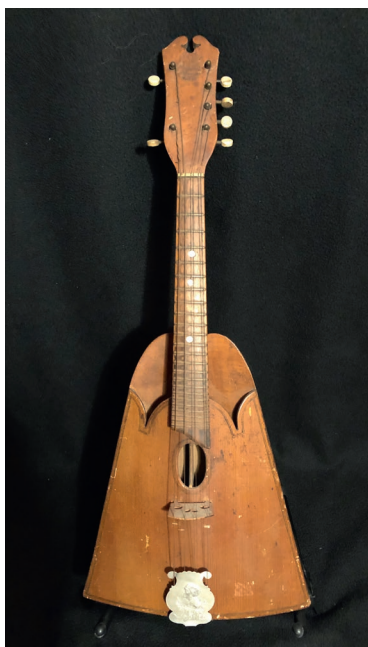
Oberhoffer's Mandolin=Violin Völklingen; 1900s