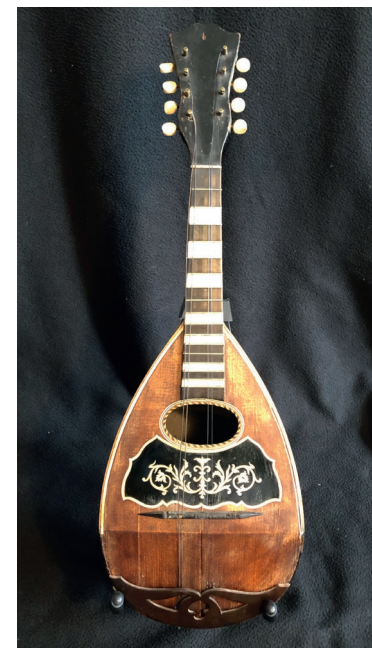
New Phone Barcelona; 1930s