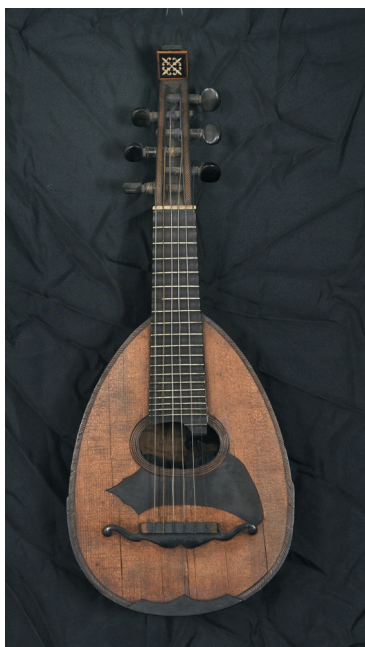
C.Albertini, Milanese style 1900s