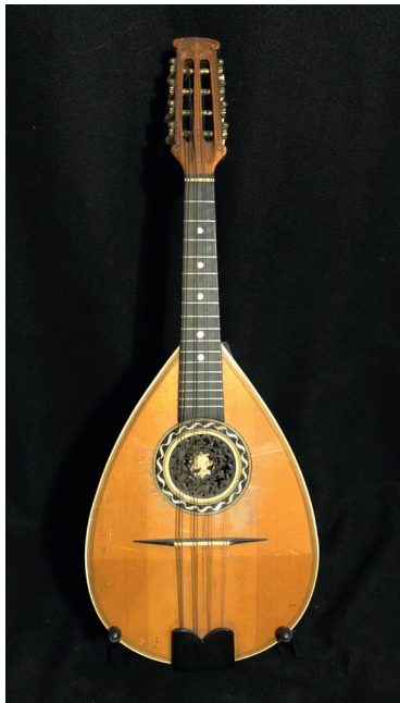
Unknown, birdseye maple 1920s