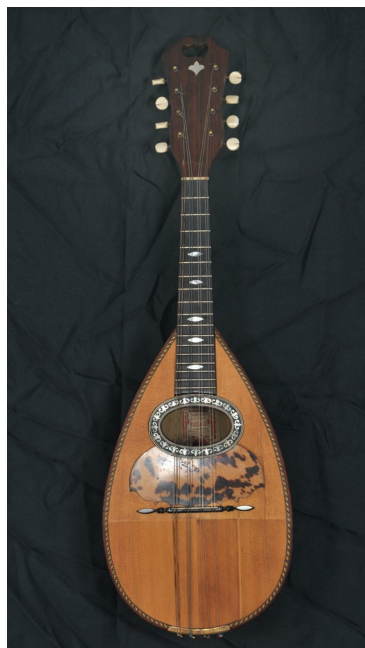
V.Mahillon Brussels; 1880s