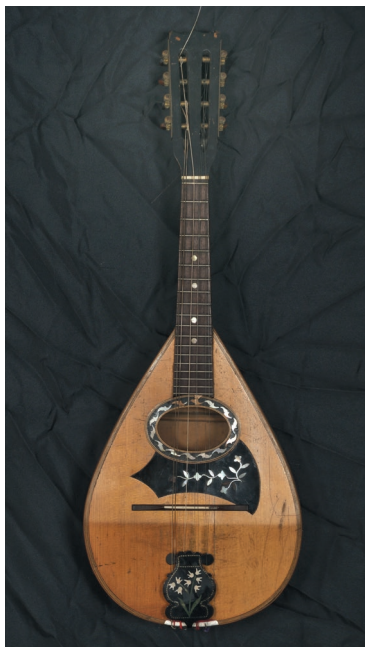
L.Olliers (?) Brevete 1900s