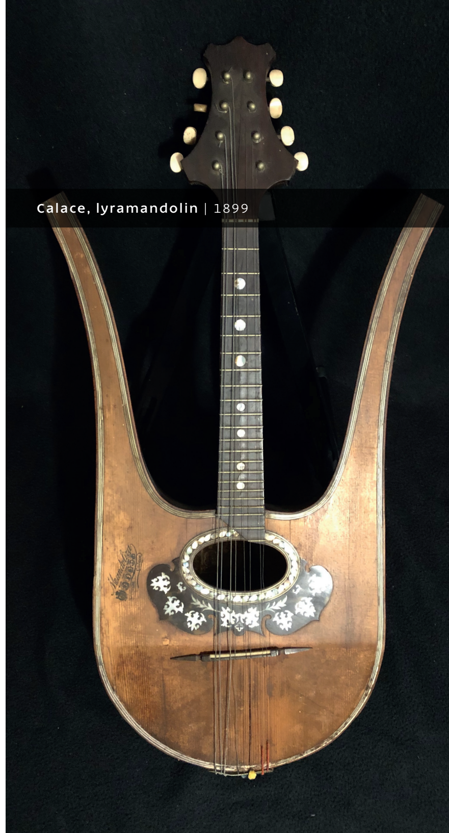
Calace, lyramandolin | 1899