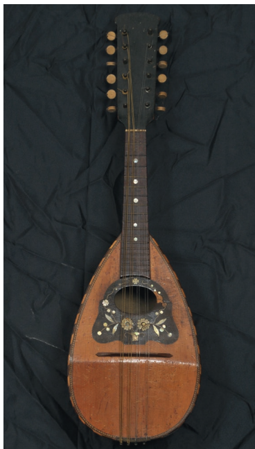
Unknown, German Mandriola; 1920