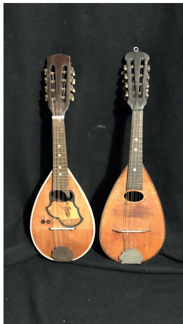
2 small mandolins Germany; 1930s (TL 38,5cm)