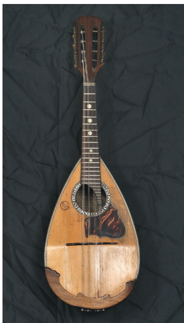
M.Maciocchi Paris; 1900s