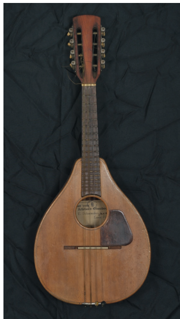
A.Schoemaker Laren; 1948