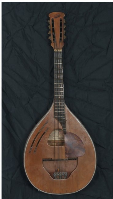
M.Maciocchi Paris; 1910s