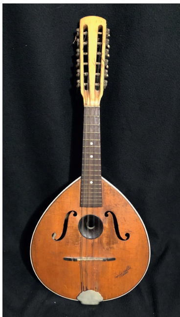
Radionella Germany; 1930s