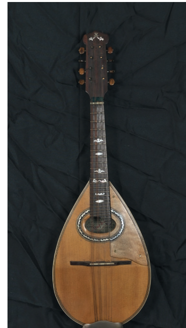
Clifford Essex Grand Concert Norfolk; 1910s