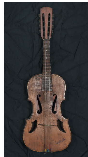
Götz, mandoviolin 1920s