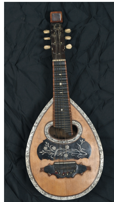
Carraba, Milanese style Napoli; 1898