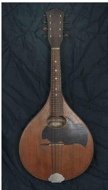
A.Bauer Linz; 1890s