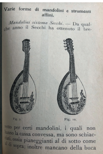
Mandolin, sistema Secchi 1890s (*)