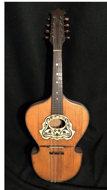
Unknown English(?); 1910s