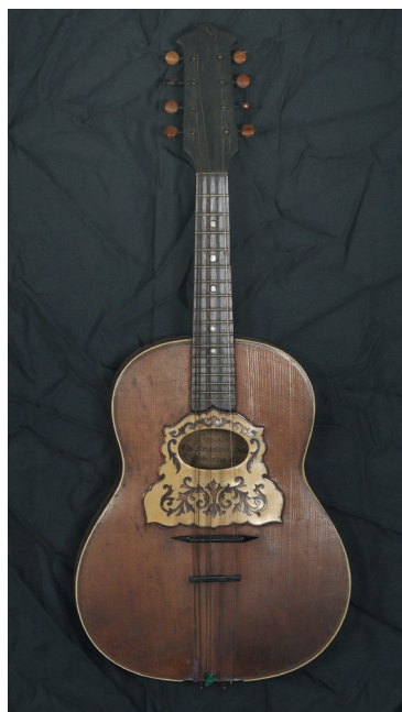
The Neapolitan Mando Co. No. 2272 1910s (Illustration back)