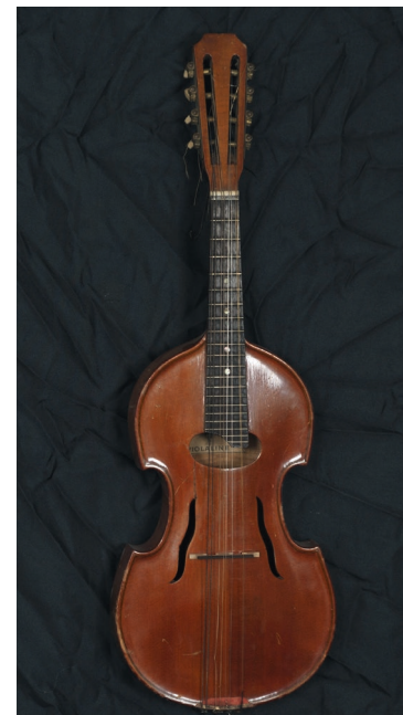
J.T.L. Violaline 1910s