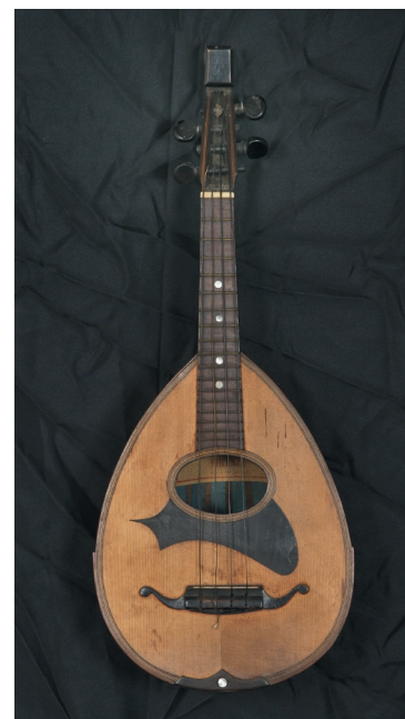
R.Maurri, Tuscan model Firenze; 1880s