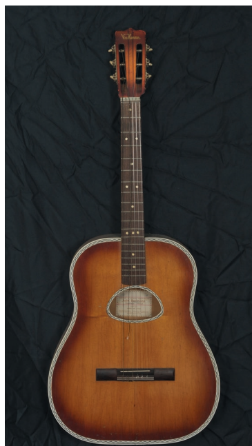
Vox Humana Vlaardingen; 1962