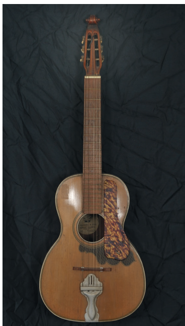
Pagano & Figli Catania / Edinburgh; 1910s