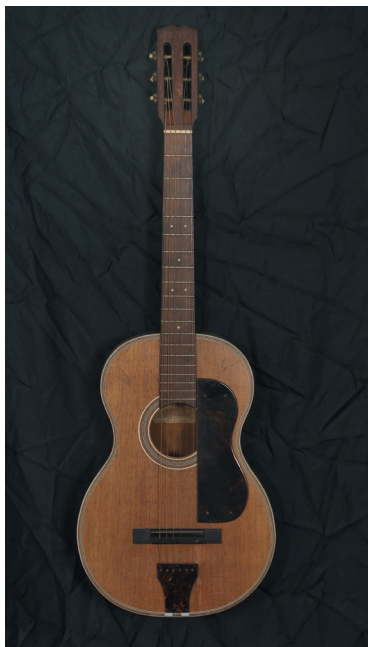
La Foley London; 1900s