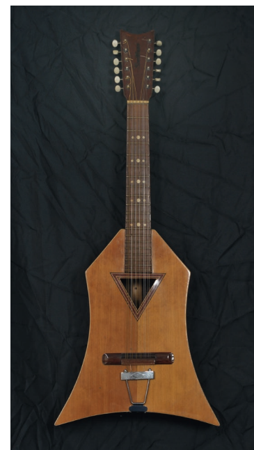
Som D'Ouro Italy; 1970s