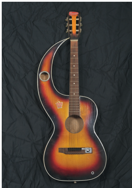
Fasan West-Germany; 1950s