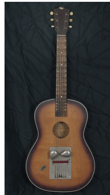
REBA (made by Maestro) pat., Zwolle; 1950s