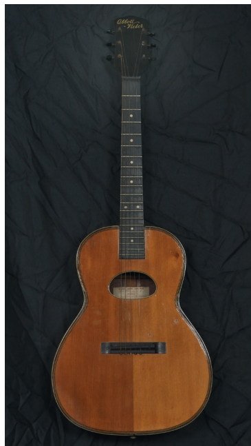
Abbott-Victor London; 1920s