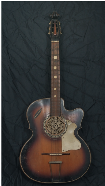
Agatino Patane, mandolinismo Catania; 1950s