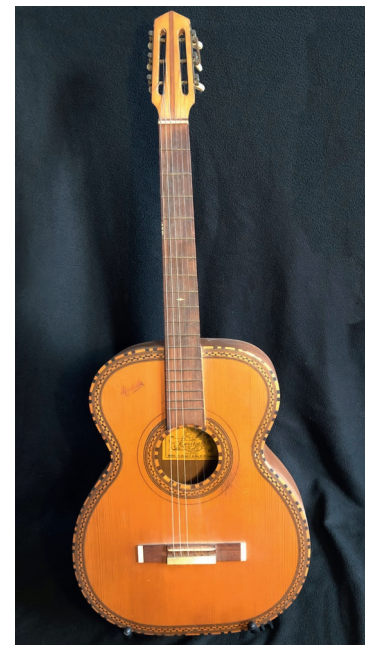
Musikalia Catania; 1950s