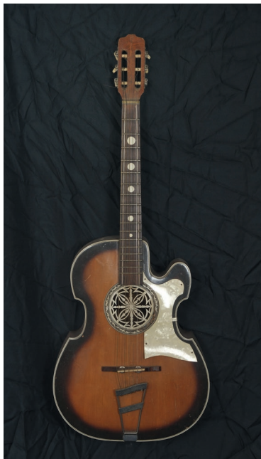
Prob. Patane Catania; 1950s