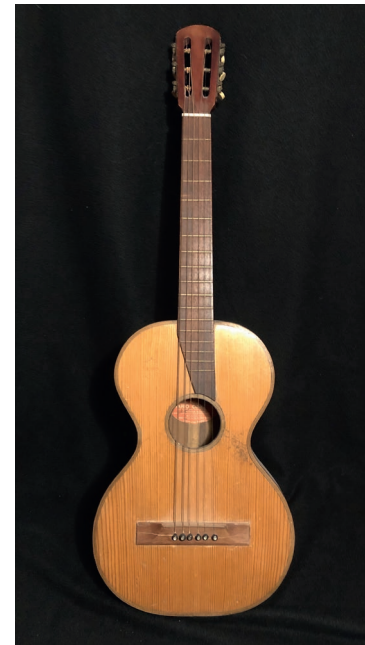
M.Casella Catania; 1900s