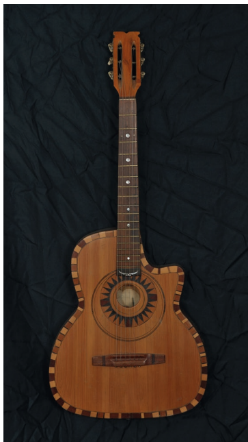
C.Garozzo Catania; 1930s