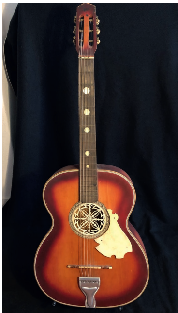
Prob. Patane Catania; 1950s