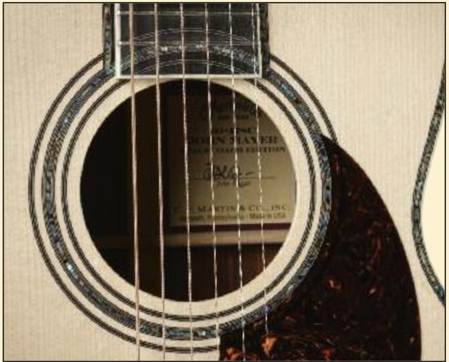
Like its predecessor, the most distinctive element of the 00-42SC is the unique inlay at the end of the fingerboard – in effect completing the circular rosette. Conceived by John Mayer, the stagecoach models are the first Martin guitars to incorporate such a challenging and beautiful completed rosette inlay. John is shown below with the original 00-45SC Stagecoach Edition in Laurel Canyon, California.

Authorized C. F. Martin dealers are now accepting orders for the 00-42SC John Mayer Custom Signature Edition. Additional information can be found online at the Martin website: www.martinguitar.com .